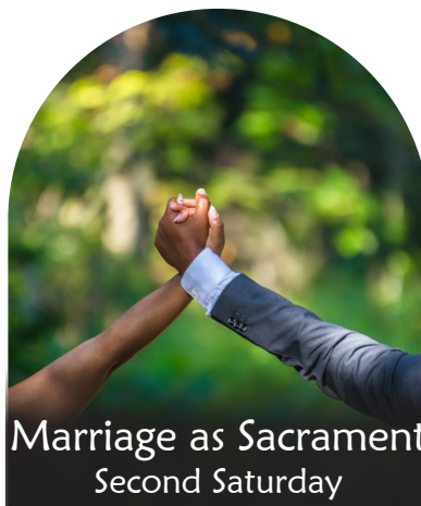
Marriage as Sacrament Second Saturday

(for first time and convalidating couples)