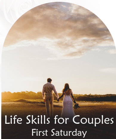
Life Skills for Couples First Saturday

This program is grounded in the teaching of the Catholic Church and especially Pope St. John Paul II's Theology of the Body. It integrates sound Catholic anthropology, psychology, and relationship principles applied to marriage and family life.