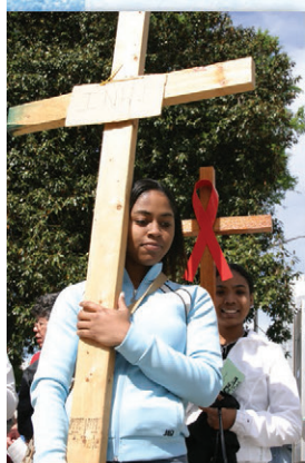
✠ Wilton D. Gregory Archbishop of Atlanta