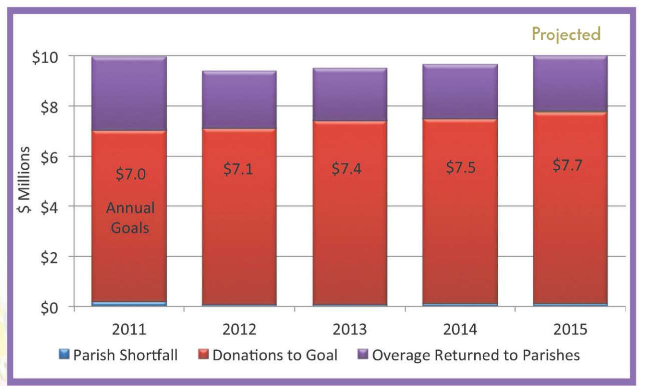
Annual Appeal History Calendar Year

Stewardship: A Disciple's Response The U.S. Bishops' Pastoral Letter on Stewardship