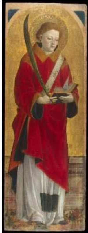
SAINT STEPHEN DEACON & MARTYR