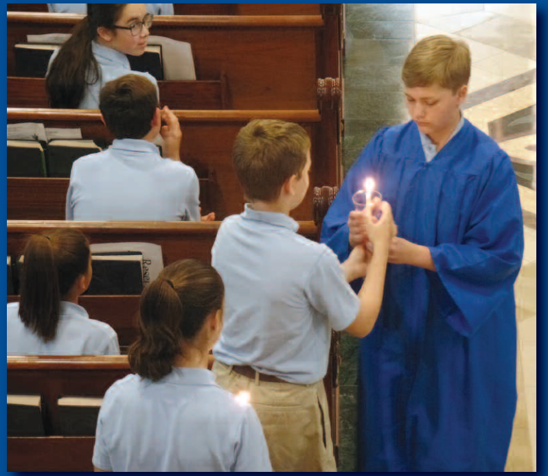
Cover Photo: Guardian Bench provided through a grant from the Catholic Foundation of North Georgia