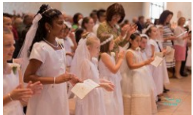
Almost 1900 classes increasing knowledge of our faith for almost 700 students

All of this cannot happen without you. Thank you so much for your support. Please give generously in the future so that together we can continue sowing the seeds of God’s love.