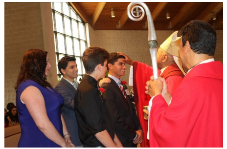
Other sacraments and liturgies where the grace of our Lord is poured onto many including 122 baptisms, 167 First Communions and First Reconciliations, 125 Confirmations, 22 Marriages, 134 Anointings of the Sick, 9 Professions of the Faith, 41 funerals and well over 50 hours of confessions