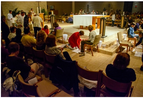
618 Masses bringing Jesus in body, blood, soul, divinity and word