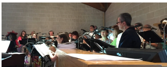
Over 140 practices to bring beautifully uplifting music to Masses, weddings, and funerals