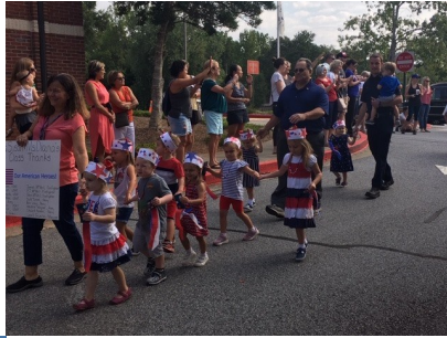
Over 1250 preschool classes and events for 96 pre-schoolers