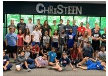
Over 200 classes and meetings for over 350 teens