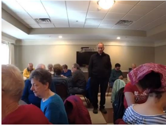
Almost 500 classes for adults